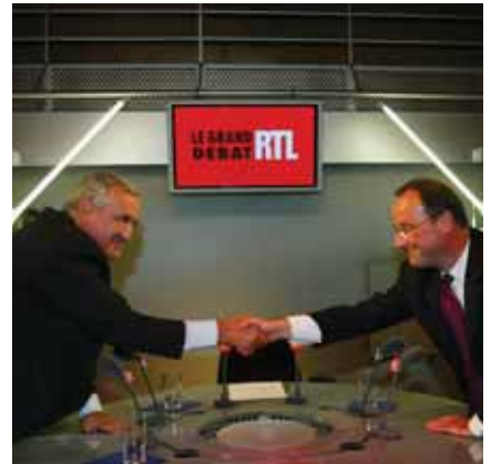
Le Grand Débat , between the Prime Minister and the leader of the shadow cabinet, in RTL's 'Grand Studio'