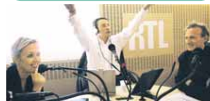
Julien Courbet hosting his entertainment show, Ça peut vous arriver

Fun Radio was a partner in many special events, ranging from broadcast concerts and sports tours to live shows and major movies such as Starky & Hutch . The station had a huge success with a new Fun Live show, mounted in partnership with Wanadoo and featuring 17 well-known artists.